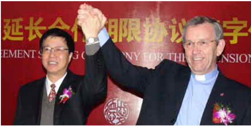
Amity Printing Company