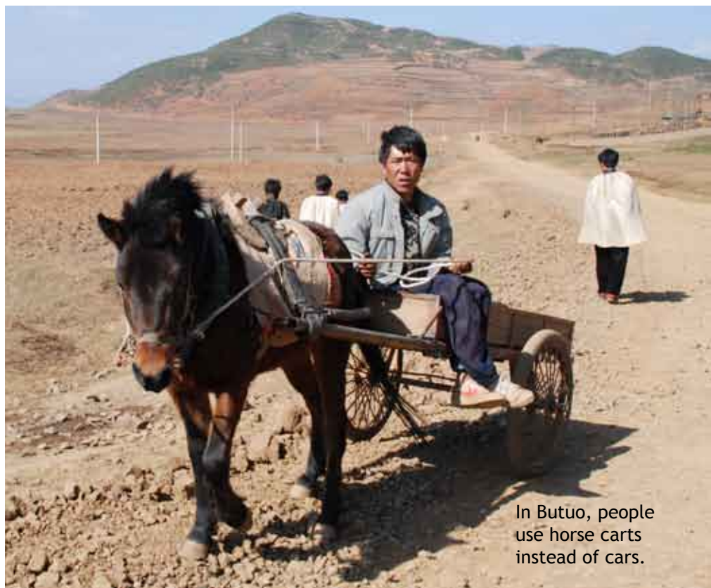
In Butuo, people use horse carts instead of cars.

The sun is setting when we arrive at the village. At the end of a narrow path in front of an earthen wall, a young mother and a group of children sit on a pile of corn stalks, basking in