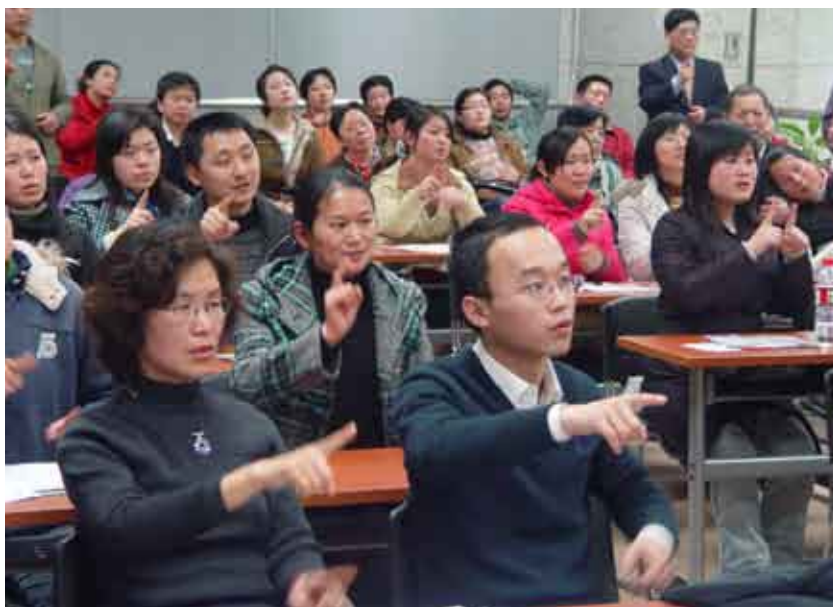
People from all walks of life join Amity's sign language classes.

Replanting a potted plant is a long and tedious process. In his book, "Mirror of Flowers", the 17th century horticulturist Chen Haozi recorded minutely what it takes to do it right: choosing the right environment, pruning, replacing the soil and watering the plant. Only if the replanting process is done with the utmost care will the "courtyard bustle with flowers". In a similar way, replanting "European-grown" bilingual deaf education into Chinese soil is a major task. Over the last four years, strong efforts have been made to introduce Amity's SigAm Bilingual Deaf Education Program to eight different deaf schools in Jiangsu, Guizhou and Sichuan provinces. Now Amity's efforts start showing signs of success.