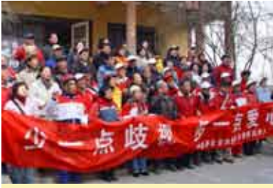
At a gathering of a self-help group of leprosy patients organized by Amity. The banner reads: less prejudice, more love.

The Amity Newsletter is a quarterly publication reporting on the projects of the Amity Foundation. It is distributed free of charge. However, we welcome an annual contribution of US$10 from readers.