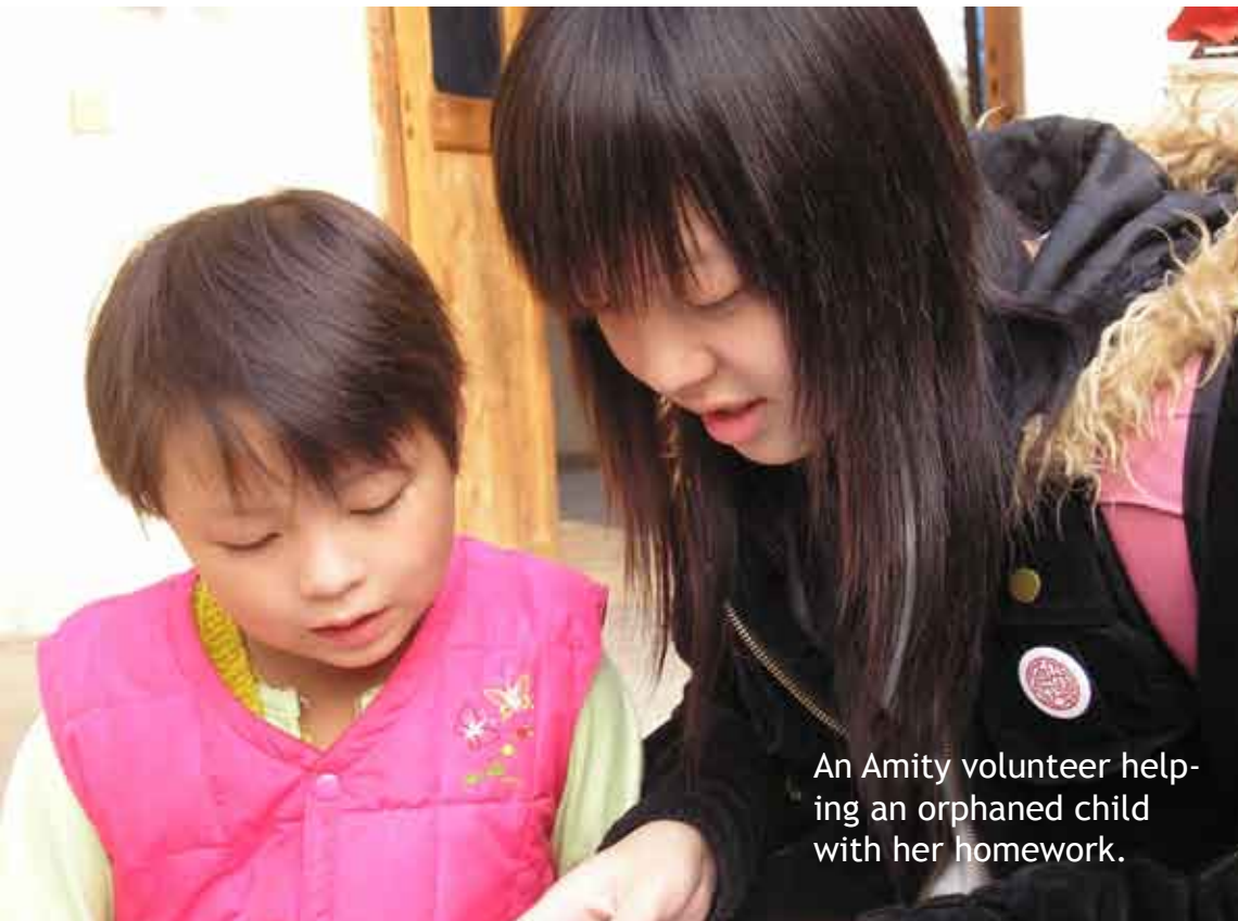
An Amity volunteer helping an orphaned child with her homework.